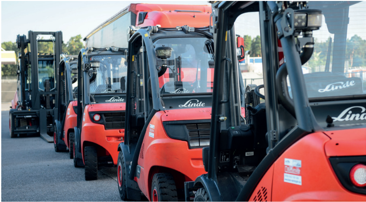
Fleet Returns Linde Approved Trucks are typically returns from our Linde owned rental fleets, maintained from new by Linde engineers.